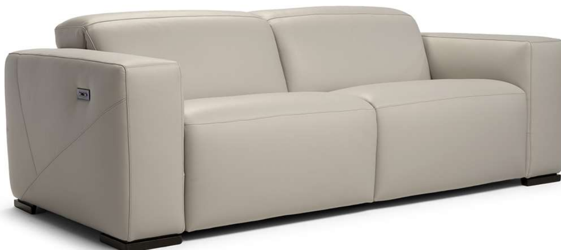
■ Vers. F46