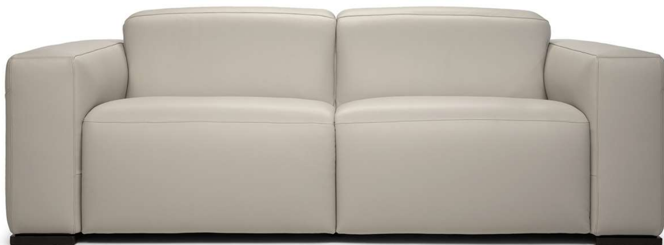
■ Vers. F46