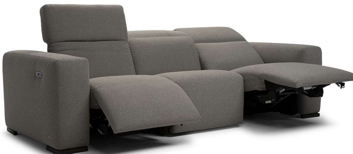
■ Vers. F00+001+F02