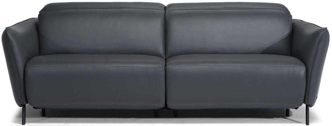
■ Vers. F46