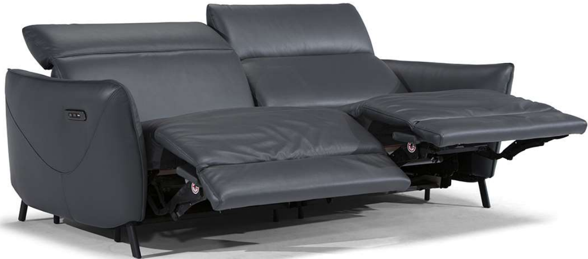
■ Vers. F46