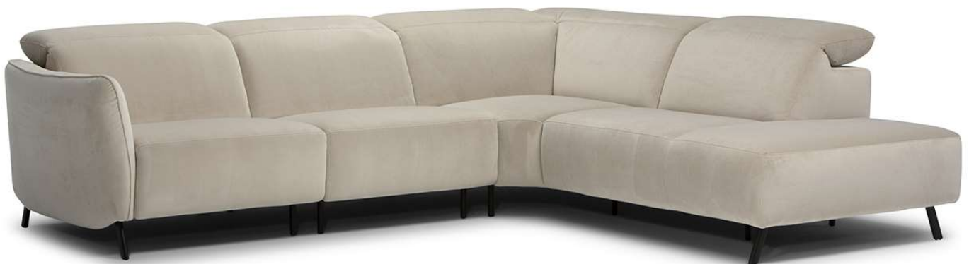
■ Vers. 272+291+481