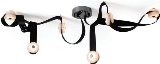
Configuration 3 • 22" h x 58" w x 18" d