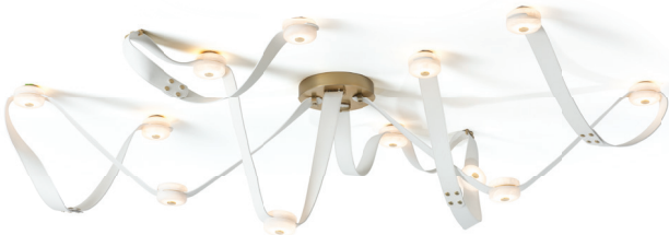
Configuration 2 • 22" h x 86.5" w x 48" d