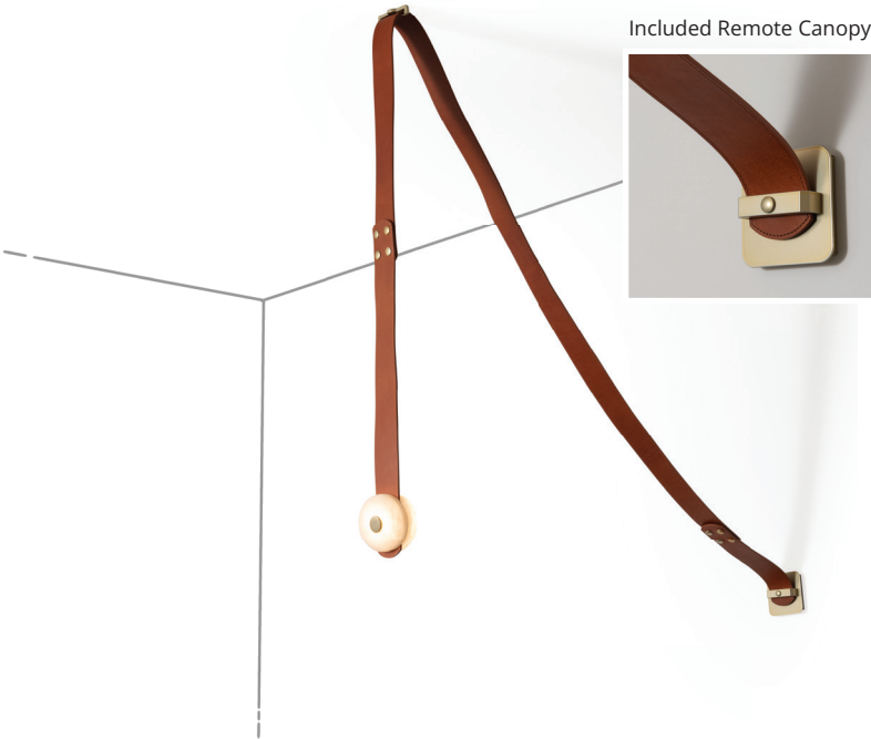
Configuration 1 • 34.7" h x 4" w x 2.6" d