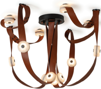
Configuration 4 • 27" h x 43" w x 43" d