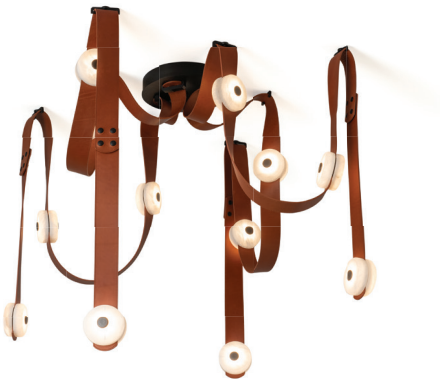
Configuration 3 • 38" h x 44" w x 44" d