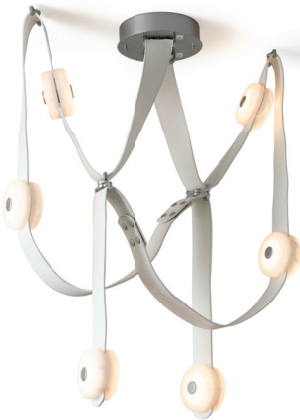
Configuration 2 • 44" h x 27" w x 5" d

Please note that natural color variations will occur with genuine leather. Characteristics will differ from hide to hide depending upon how each absorbs the dye.