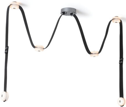
Configuration 4 • 45" h x 60" w x 4" d