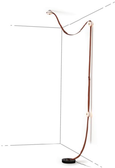
Configuration 1 • 108" h x 36" w x 10.5" d