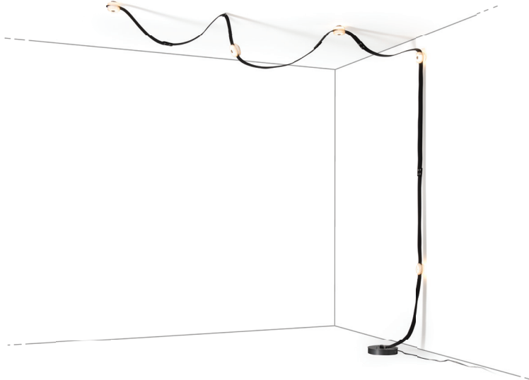
Configuration 2 • (with additional 905701 & 905713 Straps) 108" h x 110" w x 10.5" d