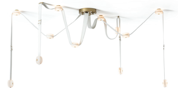
Configuration 1 • 44" h x 86.5" w x 45" d