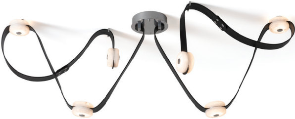
Configuration 1 • 21" h x 58" w x 16" d