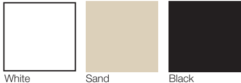
White Sand Black

⚠️ ADVERTENCIA: Cáncer - www.P65Warnings.ca.gov .