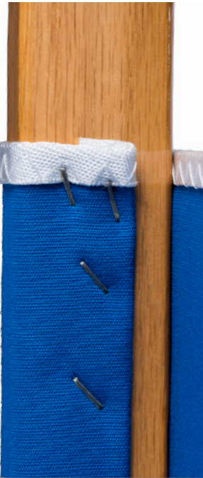
STAINLESS STEEL IMPACT STAPLES