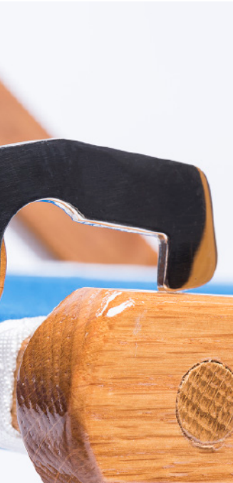
DETACHABLE FOOT REST