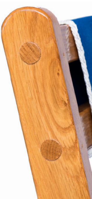
DOUBLE DOWEL SUPPORT