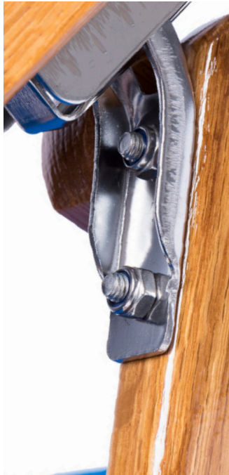
STAINLESS STEEL HARDWARE