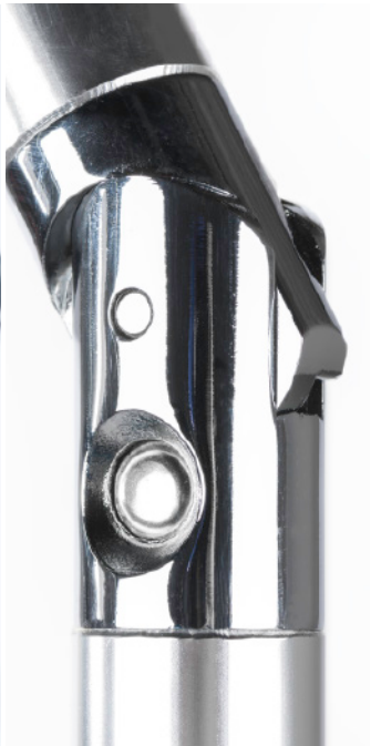
COMMERCIAL PUSH BUTTON TILT