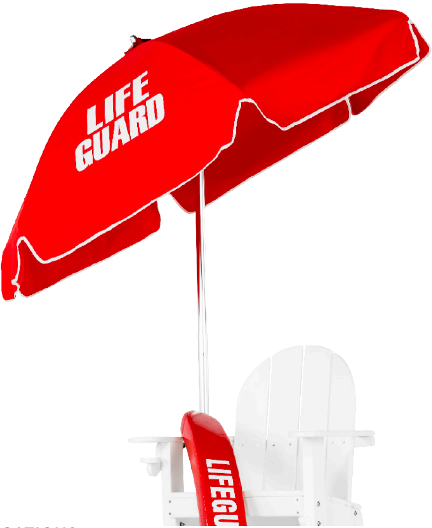
SHOWN: 639AT-LR FABRIC: LOGO RED PRINTED LIFEGUARD