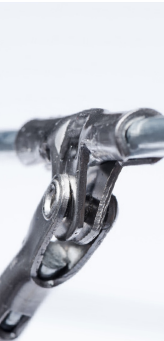
SUPERIOR 5MM STEEL FRAME AND STAINLESS STEEL JOINTS