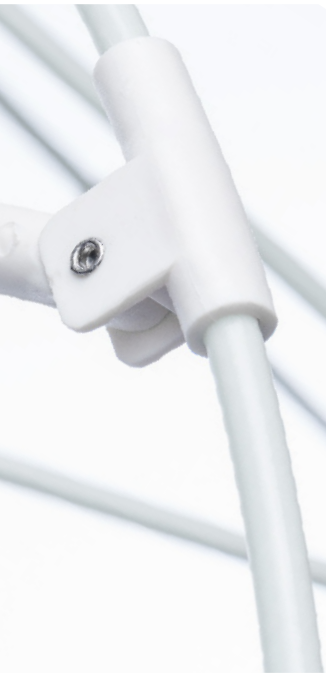
FLEXIBLE FIBERGLASS FRAME