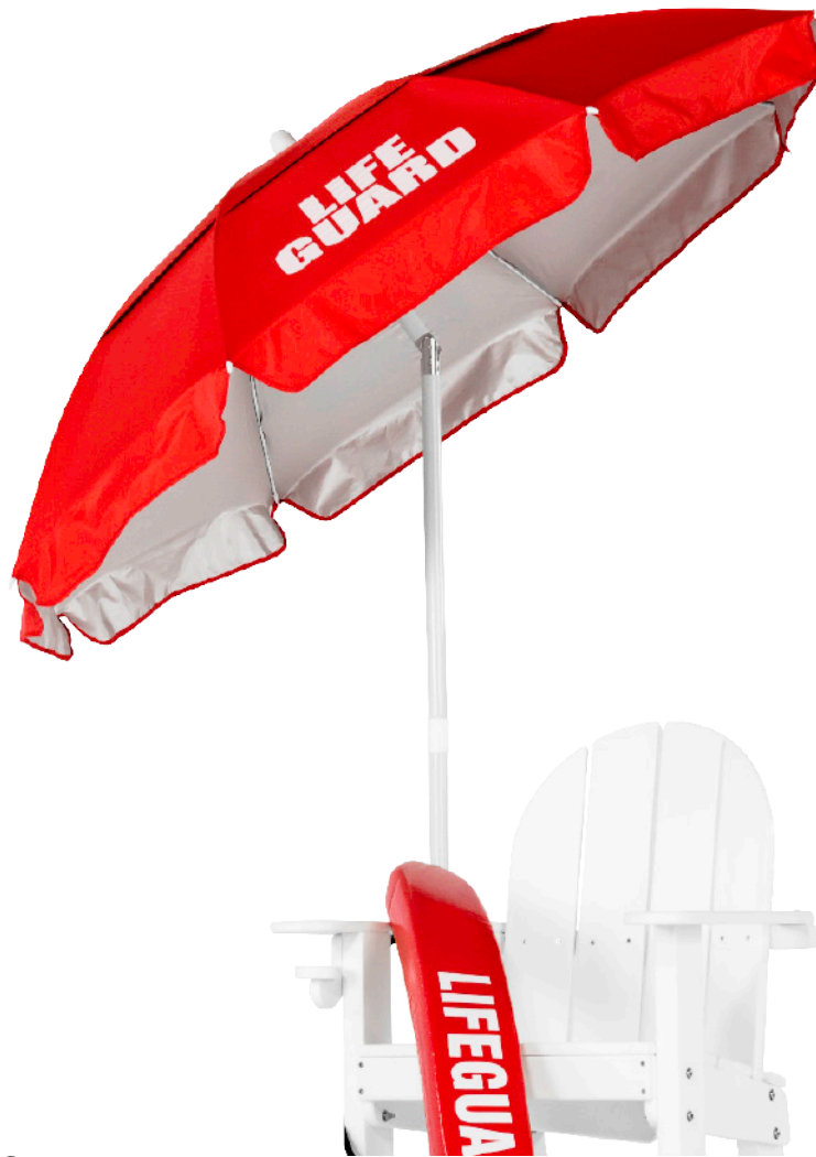
SHOWN: FT101-LR FABRIC: RED POLYESTER PRINTED LIFEGUARD