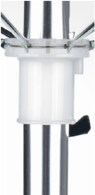
EZ-UP STEEL SPRING LEDGE

These lifeguard umbrellas combine strength with style. Choose from a steel zinc-plated frame with an acrylic or vinyl canopy, or a durable fiberglass frame with acrylic canopy. Available with the traditional "Lifeguard" printing, or unprinted. The spring activated steel ledge, stainless steel parts, and commercially warranted tilt ensure long lasting protection from the elements for your vital pool protectors.