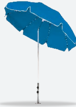
845AT - 7.5' / 2.3M OCTAGON

OPERATION: manual lift / no tilt STYLE: VALANCE/NO VENT