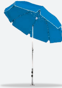
845CT - 7.5' / 2.3M OCTAGON

OPERATION: manual lift / tilt STYLE: VALANCE/NO VENT