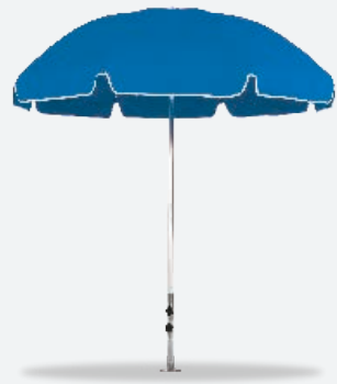
845A - 7.5' / 2.3M OCTAGON

A. overall height: 92" / 236cm B. clearance: 69" / 175cm C. closed clearance: 37" / 93cm MAST: 1.375"/34mm (Upper) 1.5" / 38mm (Lower)