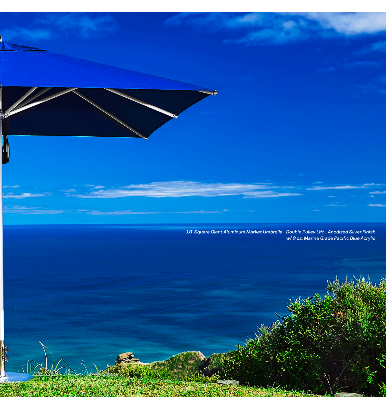
10' Square Giant Aluminum Market Umbrella - Double Pulley Lift - Anodized Silver Finish w/ 9 oz. Marine Grade Pacific Blue Acrylic

The G-Series is the flagship center post umbrella for all luxury resorts, hotels, and high-end outdoor living spaces. Built with the same commercial quality materials as the Greenwich and Monterey, the G-Series offers free-standing maximum shade options on a larger 2" center post with three canopy size options. We offer permanent, semi-permanent, and free-standing base options to accommodate any outdoor space.