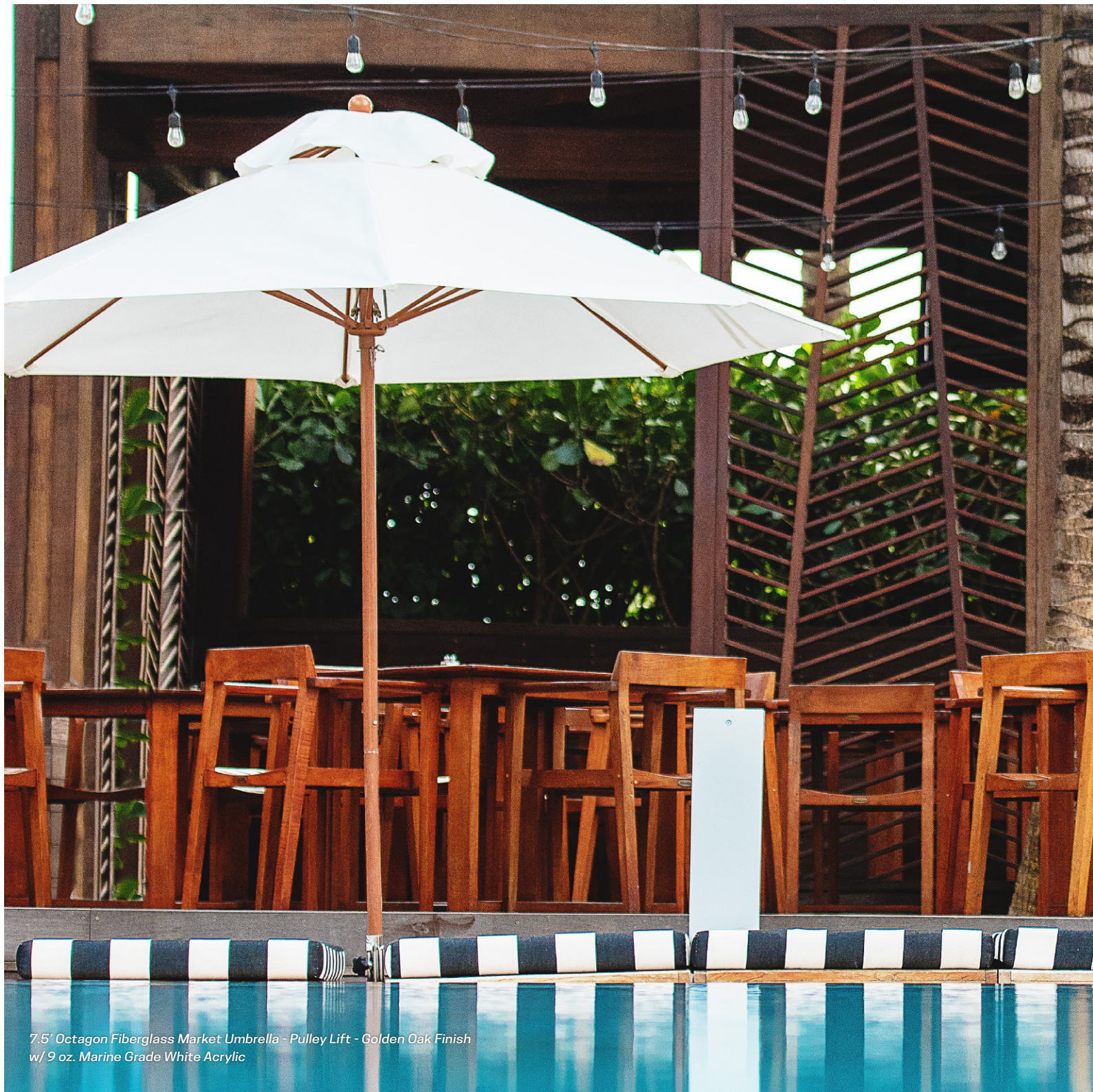
7.5' Octagon Fiberglass Market Umbrella - Pulley Lift - Golden Oak Finish w/ 9 oz. Marine Grade White Acrylic