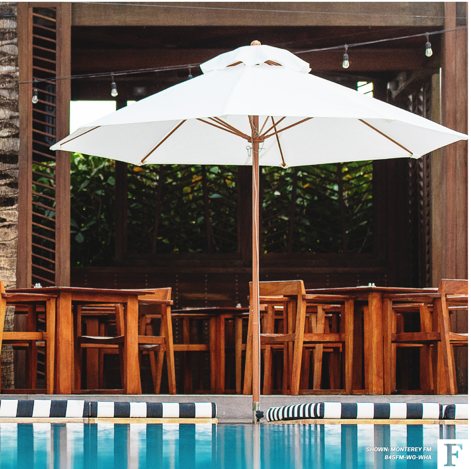
SHOWN: MONTEREY FM 845FM-WG-WHA