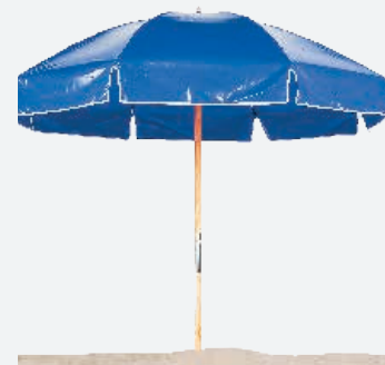
845W/AP - 7.5' / 2.3M OCTAGON (VINYL)

STYLE: VALANCE/NO VENT W: ASH WOOD / POINTED BOTTOM AP: ALUMINUM / POINTED BOTTOM