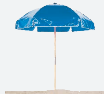
639W/AP - 6.5' / 2M HEXAGON (VINYL)

STYLE: VALANCE/NO VENT W: ASH WOOD / POINTED BOTTOM AP: ALUMINUM / POINTED BOTTOM