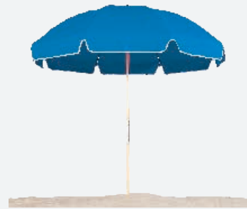
845W/AP - 7.5' / 2.3M OCTAGON