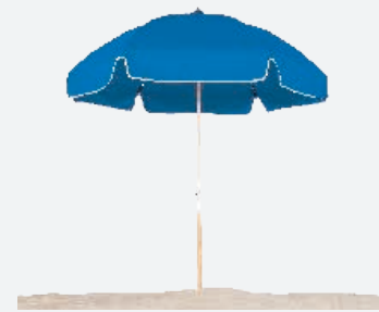
639W/AP - 6.5' / 2M HEXAGON

STYLE: VALANCE/NO VENT W: ASH WOOD / POINTED BOTTOM AP: ALUMINUM / POINTED BOTTOM