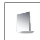
CORRUBEDO WALL LAMP