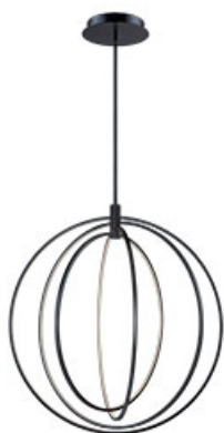
E24049-BZ Concentric LED Pendant