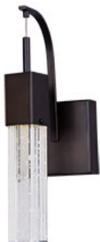
E22760-89BZ Fizz III 1-Light LED Wall Sconce