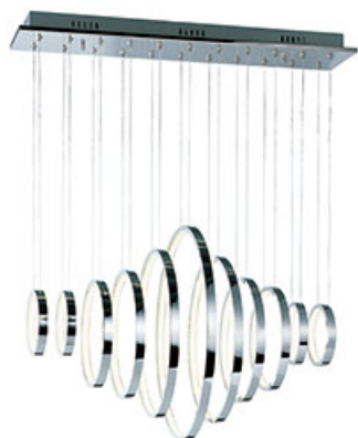
E22716-PC Hoops LED Pendant