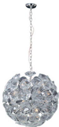
E22094-28 Cassini 20-Light Pendant