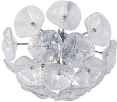
E22092-28 Cassini 8-Light Flush/Wall Mount