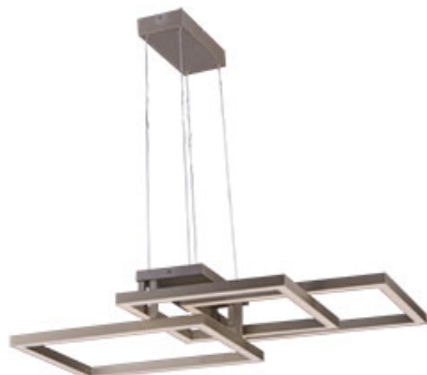
E21515-CHP Traverse LED Pendant