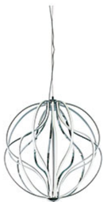
E21176-PC Aura LED 16-Light Pendant