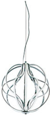
E21174-PC Aura LED 14-Light Pendant