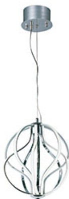
E21172-PC Aura LED 10-Light Pendant