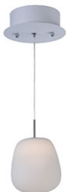
E21121-11WT Puffs 1-Light Pendant