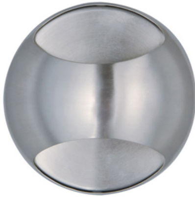
E20540-SN Wink 1-Light Wall Sconce