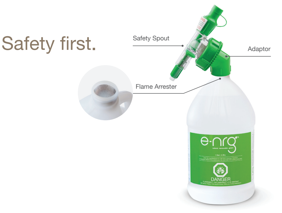
'BITR' DETTERENT FOR SAFETY