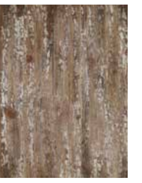
Inspired by today's casual living, this finish has a rustic raw wood look that suggests the feeling of an antique barn door.