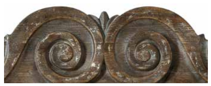
Reminiscent of an old world European antique, this soft timeworn finish with silver leaf accent lends itself to several Rhapsody items, creating a well-traveled look at home.