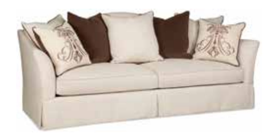
Style No. 7012-001 Body fabric: 2239 Linen (3) Back Pillows: 2239 Linen with 8389 Latte Welt (2) Back Pillows: 8389 Latte 1/2 of (2) Toss Pillows: Zitella Brown 1/2 of (2) Toss Pillows and welt: 8389 Latte shown on page 18