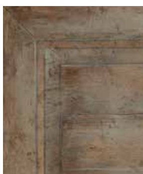
A naked bleached patina in a parchment color emulates a serene, natural wood tone.