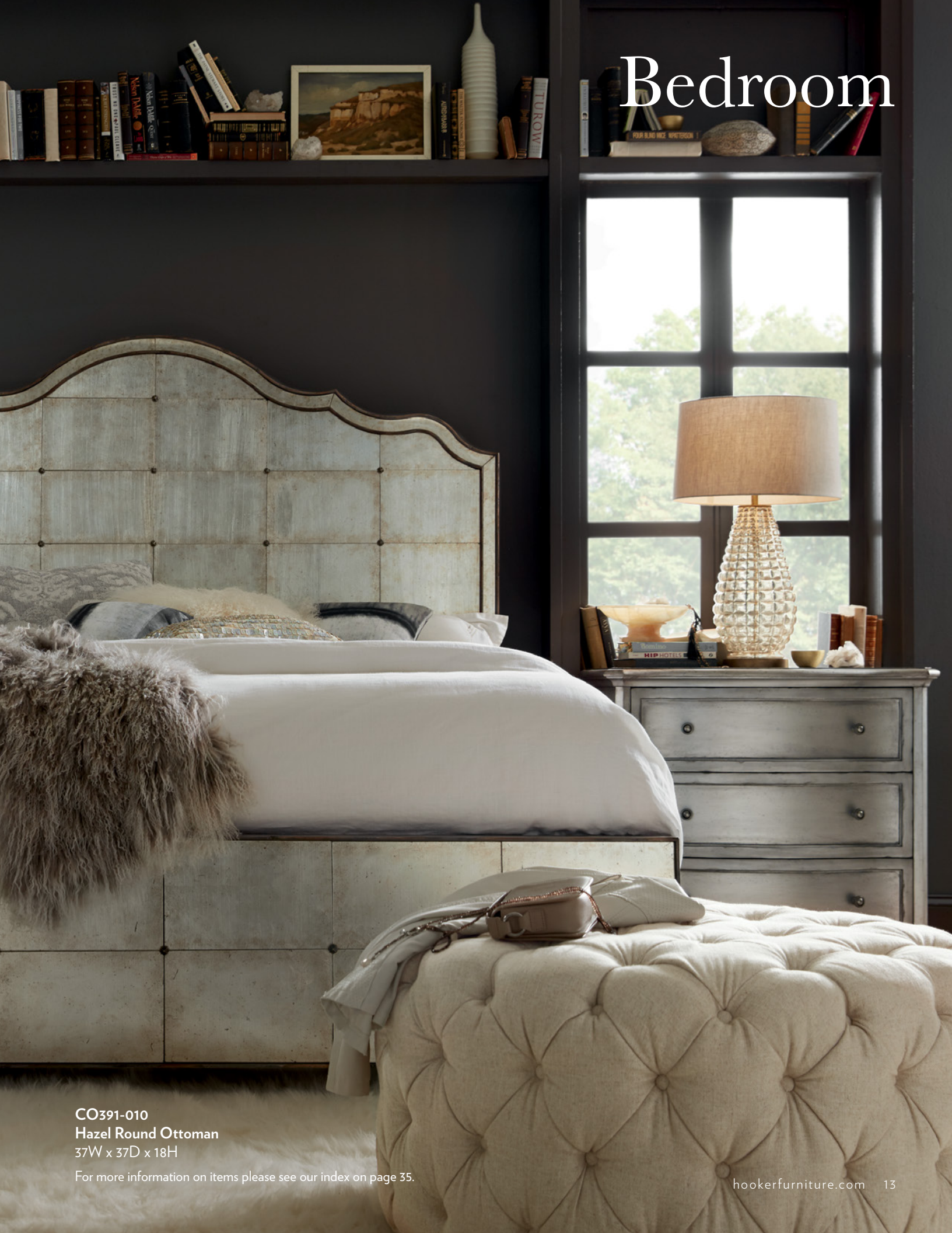
CO391-010 Hazel Round Ottoman 37W x 37D x 18H

For more information on items please see our index on page 35.