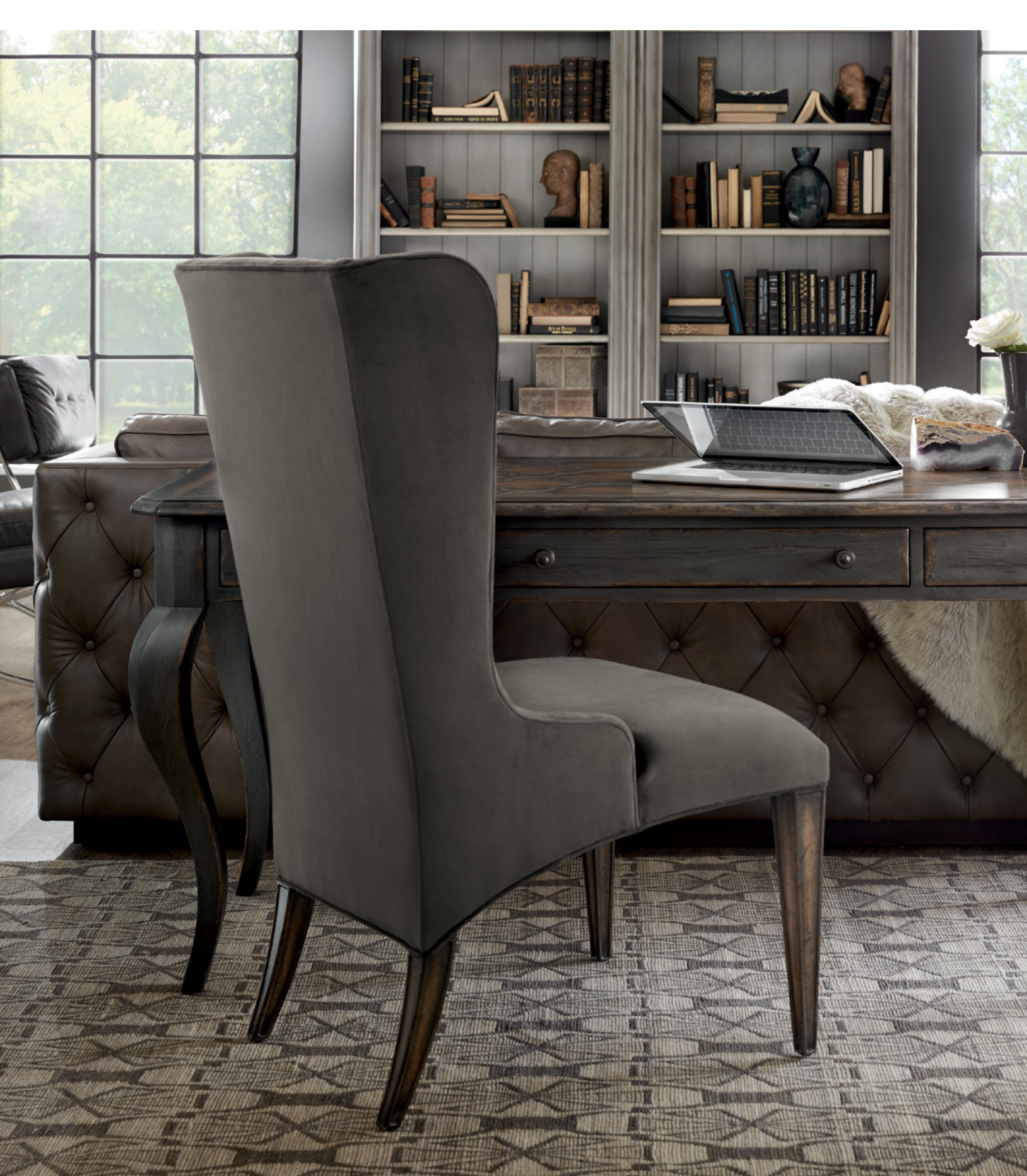
1610-35001-GRY Upholstered Host Chair 24 1/2W x 28 1/2D x 45 1/2H