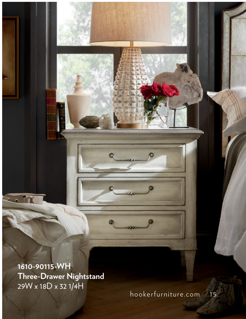
1610-90115-WH Three-Drawer Nightstand 29W x 18D x 32 1/4H