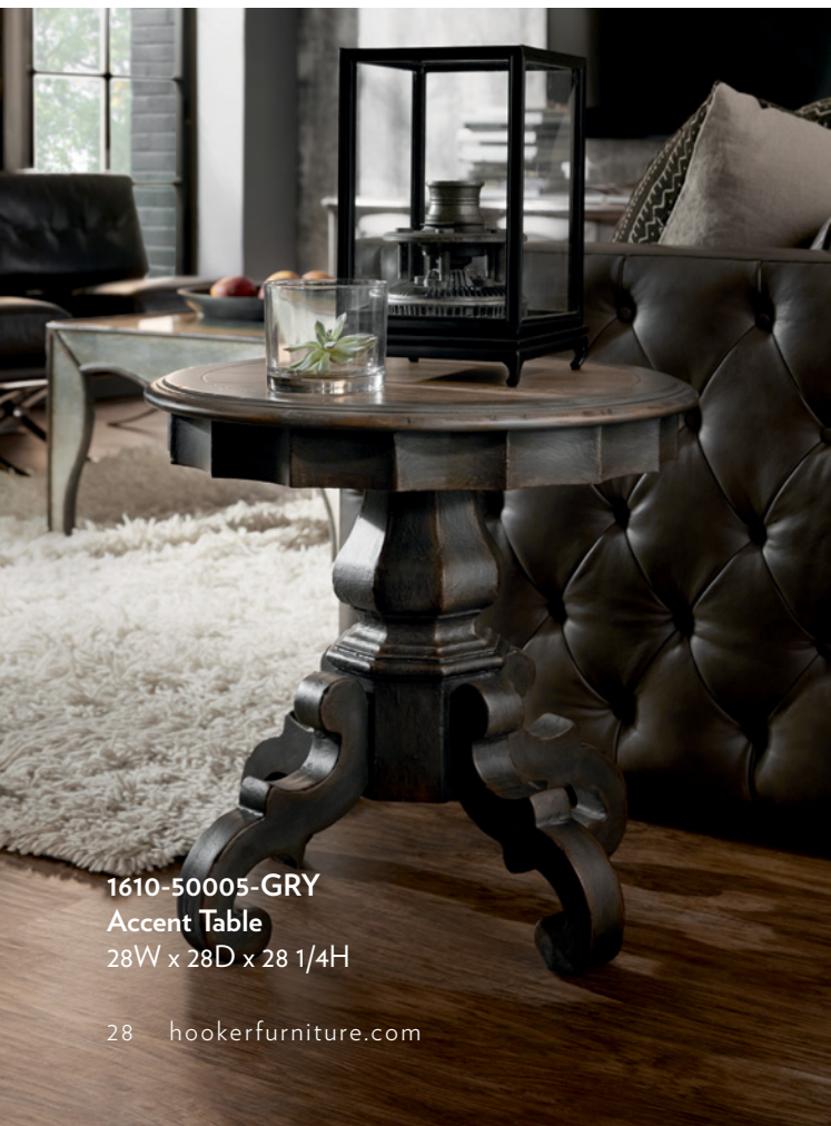
1610-50005-GRY Accent Table 28W x 28D x 28 1/4H