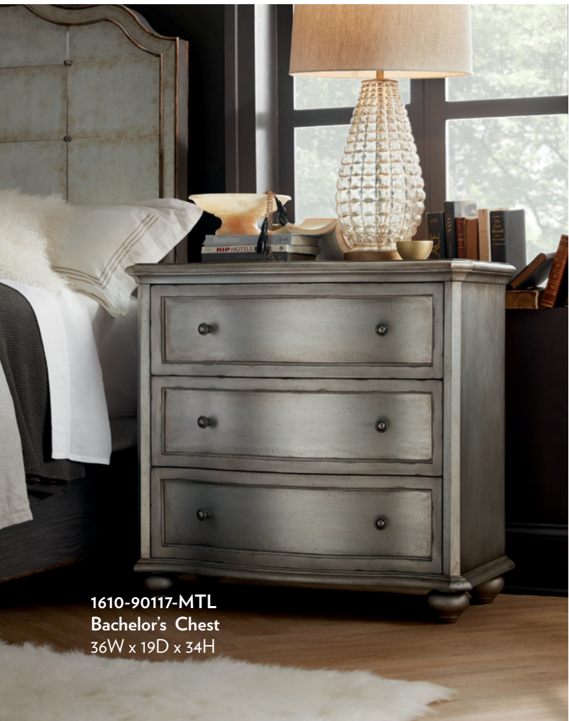
1610-90117-MTL Bachelor's Chest 36W x 19D x 34H