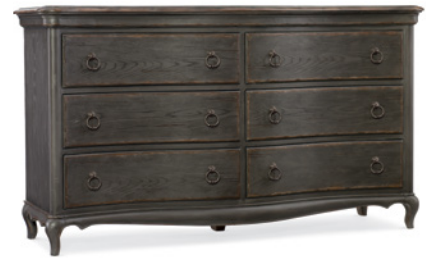
1610-90001-GRY Six-Drawer Dresser

Poplar and Hardwood With Oak, Cedar and Ebony Veneers Six drawers, top left drawer has drop in felt liner, top right drawer has removable felt jewelry tray, bottoms drawers are cedar lined 68W x 20D x 38 1/4H (173 x 51 x 97 cm) shown on page 19