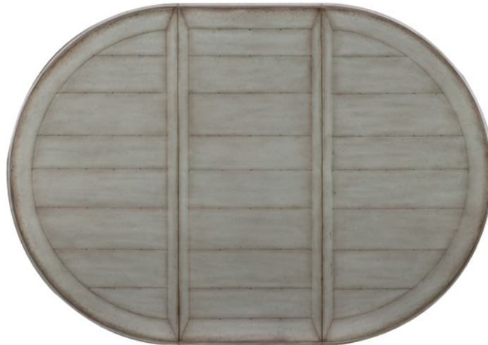
Top View of 1610-75203-WH 48" Round Leg Table with One 20" Leaf extends to 68"