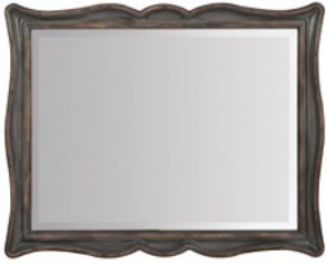
1610-90009-GRY Landscape Mirror Poplar and Hardwood Solids with Mirror 44W x 2D x 35H (112 x 5 x 89 cm) shown on page 19