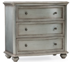
1610-90117-MTL Bachelor's Chest Poplar and Hardwood Solids with Cedar Veneer, Aluminum and Nails Three drawers, top drawer has drop in felt liner, bottom drawer has cedar bottom, one live USB port and three electrical outlets, one touch switch located on each side of case, one light underneath, cord clip, metal wrapped case and drawer fronts 36W x 19D x 34H (91 x 48 x 86 cm) shown on page 13, 15