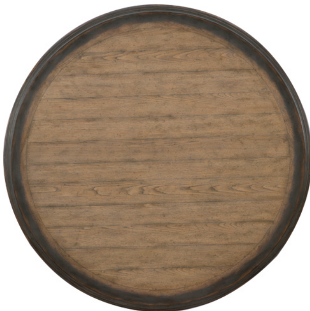
Top View of 1610-75211-GRY 72" Round Pedestal Dining Table