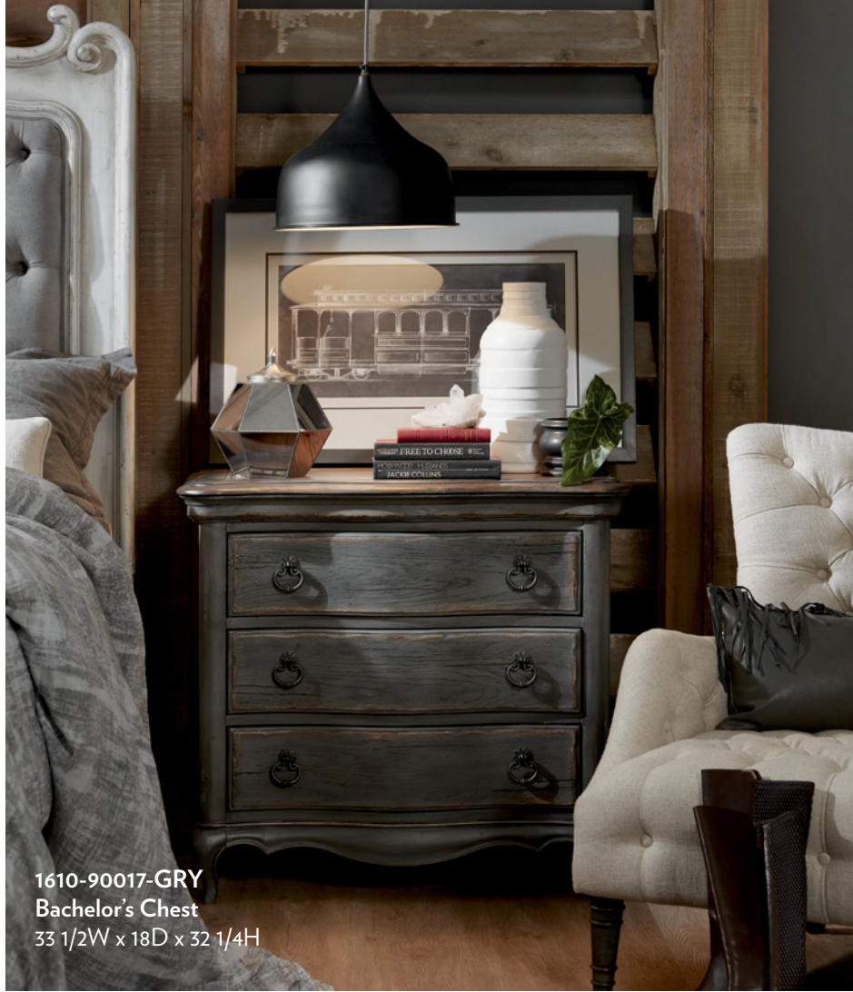
1610-90017-GRY Bachelor's Chest 33 1/2W x 18D x 32 1/4H