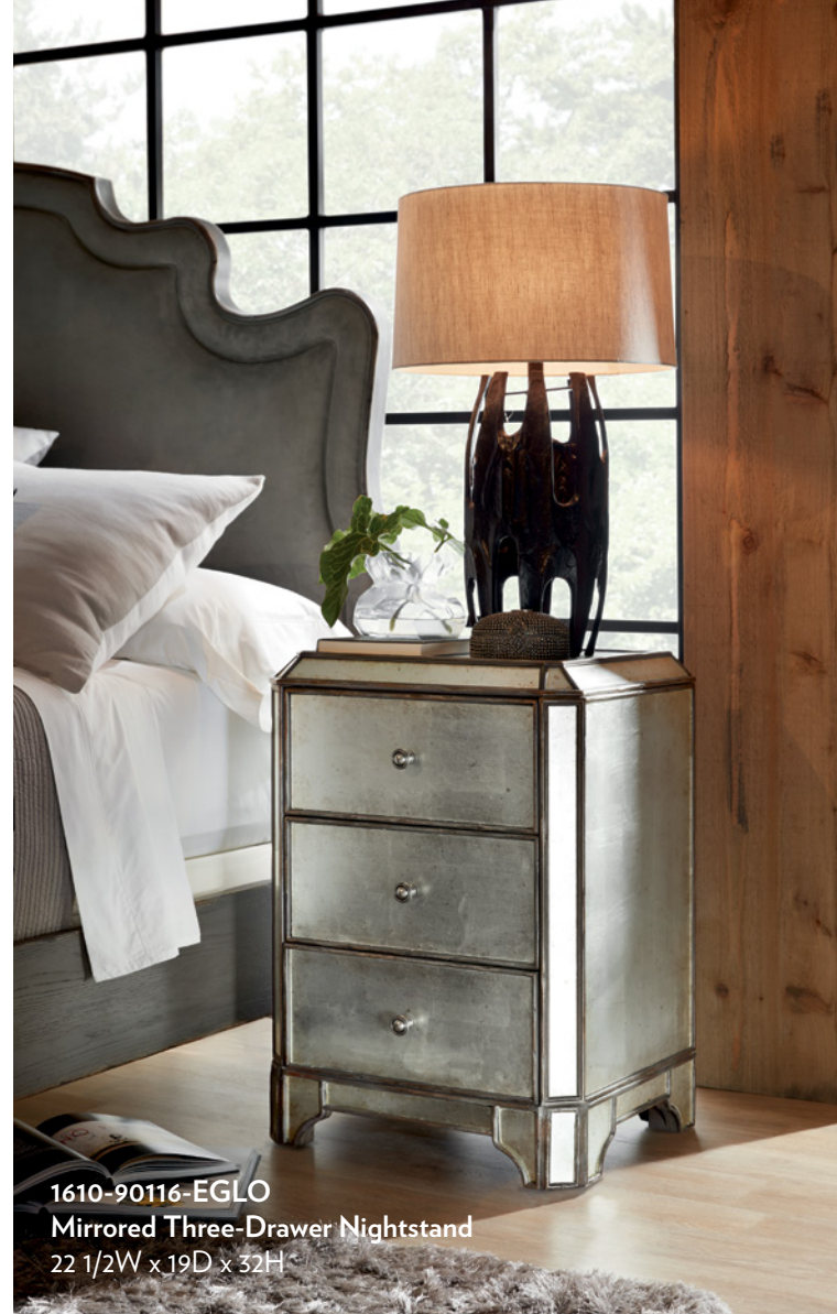
1610-90116-EGLO Mirrored Three-Drawer Nightstand 22 1/2W x 19D x 32H