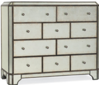
1610-90011-EGLO Ten-Drawer Bureau Poplar and Hardwood Solids with Eglomise and Cedar Ten drawers, top left drawer has a drop front and drop in felt liner, top right drawer has a removable felt lined jewelry tray, three bottom drawers are cedar lined 52 1/2W x 20 1/4D x 44H (133 x 51 x 112 cm) shown on page 20