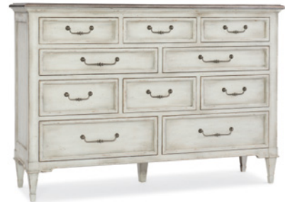
1610-90002-WH Ten-Drawer Dresser

Poplar and Hardwood With Oak, Cedar and Ebony Veneers Six drawers, top left drawer has drop in felt liner, top right drawer has removable felt jewelry tray, bottoms drawers are cedar lined 68W x 20D x 38 1/4H (173 x 51 x 97 cm) shown on page 19