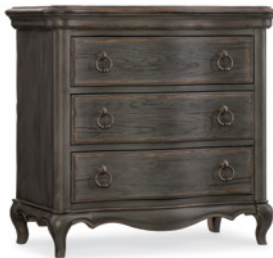
1610-90017-GRY Bachelor's Chest Poplar and Hardwood Solids with Oak, Cedar and Ebony Veneers Three drawers, bottom drawer has cedar bottom, one live USB port and three electrical outlets, one touch switch located on each side of case, one light underneath, cord clip 33 1/2W x 18D x 32 1/4H (85 x 46 x 82 cm) shown on page 17