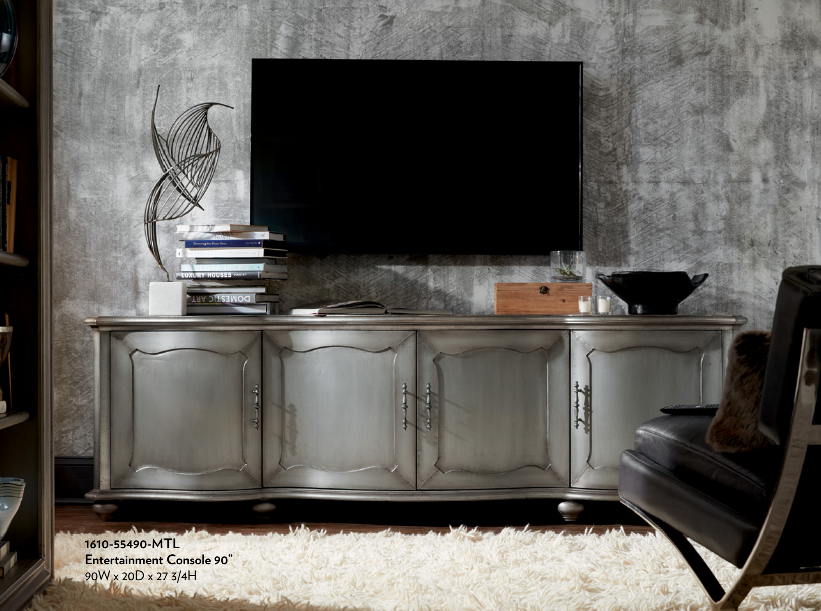
1610-55490-MTL Entertainment Console 90" 90W x 20D x 27 3/4H