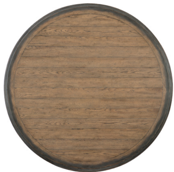
Top View of 1610-75201-GRY 60" Round Pedestal Dining Table