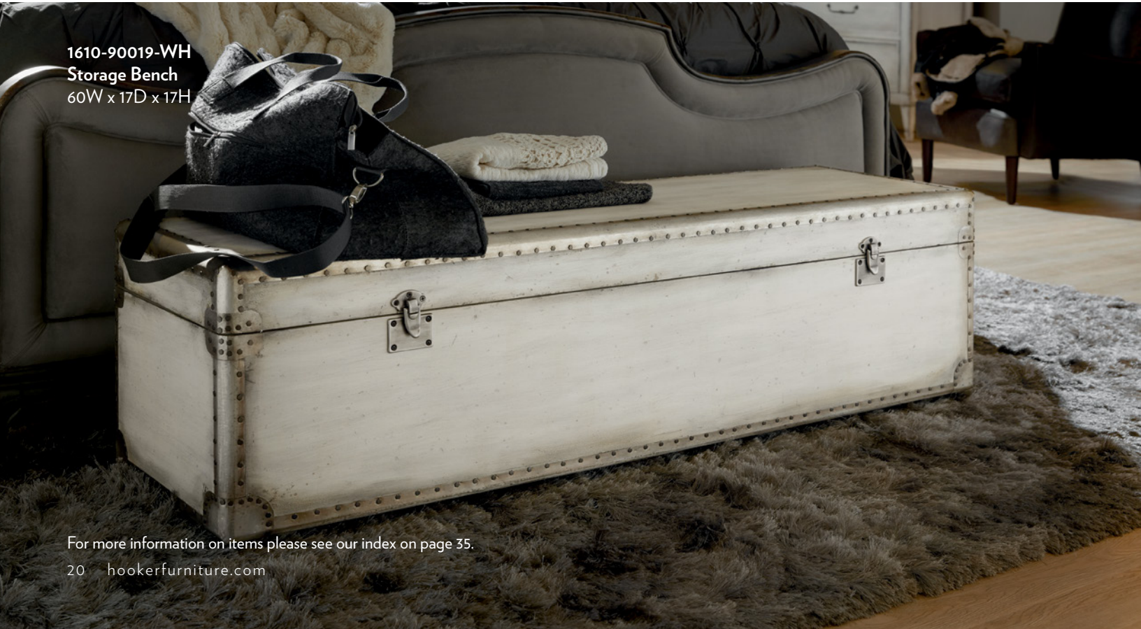
1610-90019-WH Storage Bench 60W x 17D x 17H