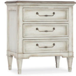
1610-90115-WH Three-Drawer Nightstand Poplar and Hardwood Solids with Maple Veneer, Aluminum and Cedar Three drawers, top drawer has drop in felt liner, bottom drawer has cedar bottom, metal wrapped top, one live USB port and three electrical outlets, one touch switch located on each side of case, one light underneath, cord clip 29W x 18D x 32 1/4H (74 x 46 x 82 cm) shown on page 12, 15