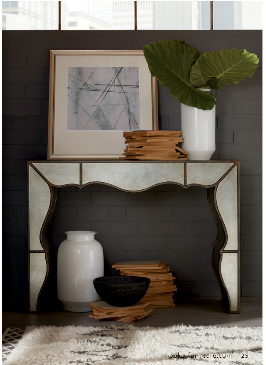
1610-85004-EGLO Mirrored Hall Console 48W x 12D x 36H

For more information on items please see our index on page 35.