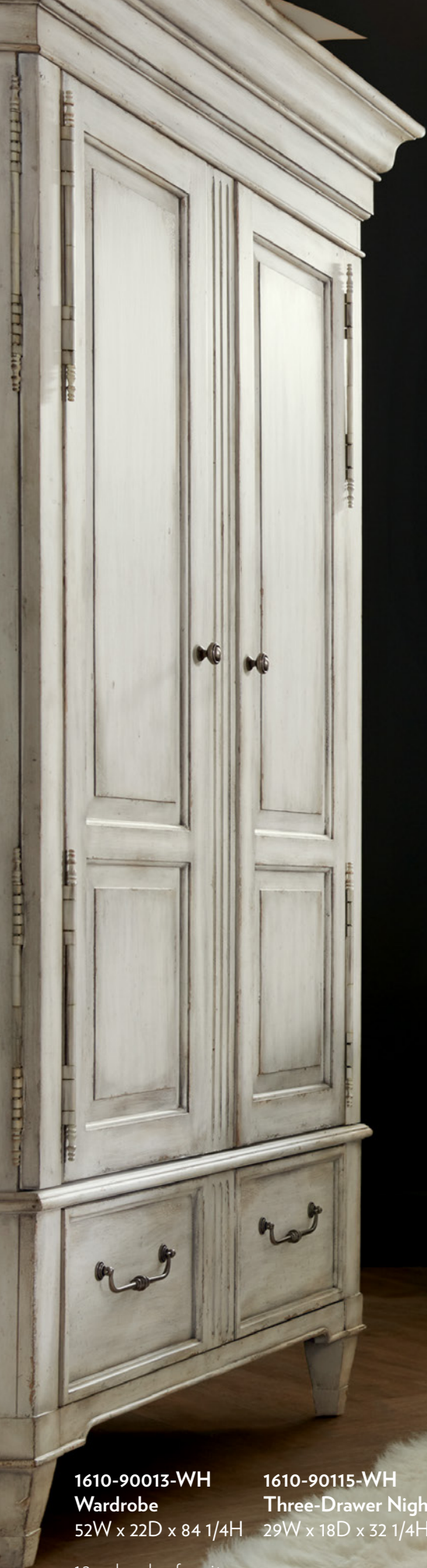
1610-90013-WH Wardrobe 52W x 22D x 84 1/4H