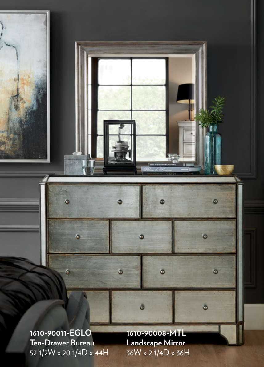
1610-90011-EGLO Ten-Drawer Bureau 52 1/2W x 20 1/4D x 44H