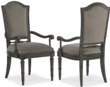
1610-75400-GRY Upholstered Back Arm Chair

Poplar, Rubberwood and Beech Solids 22 3/4W x 23 1/2D x 44H (58 x 60 x 112 cm) shown on page 10, 11