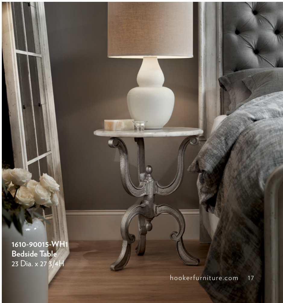
1610-90015-WH1 Bedside Table 23 Dia. x 27 3/4H