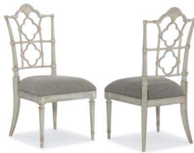
1610-75510-WH Side Dining Chair

Rubberwood and Hardwood Solids with Fabric: Fabric: Deep Fog 20W x 26D x 44 1/4H (51 x 66 x 112 cm) shown on page 5