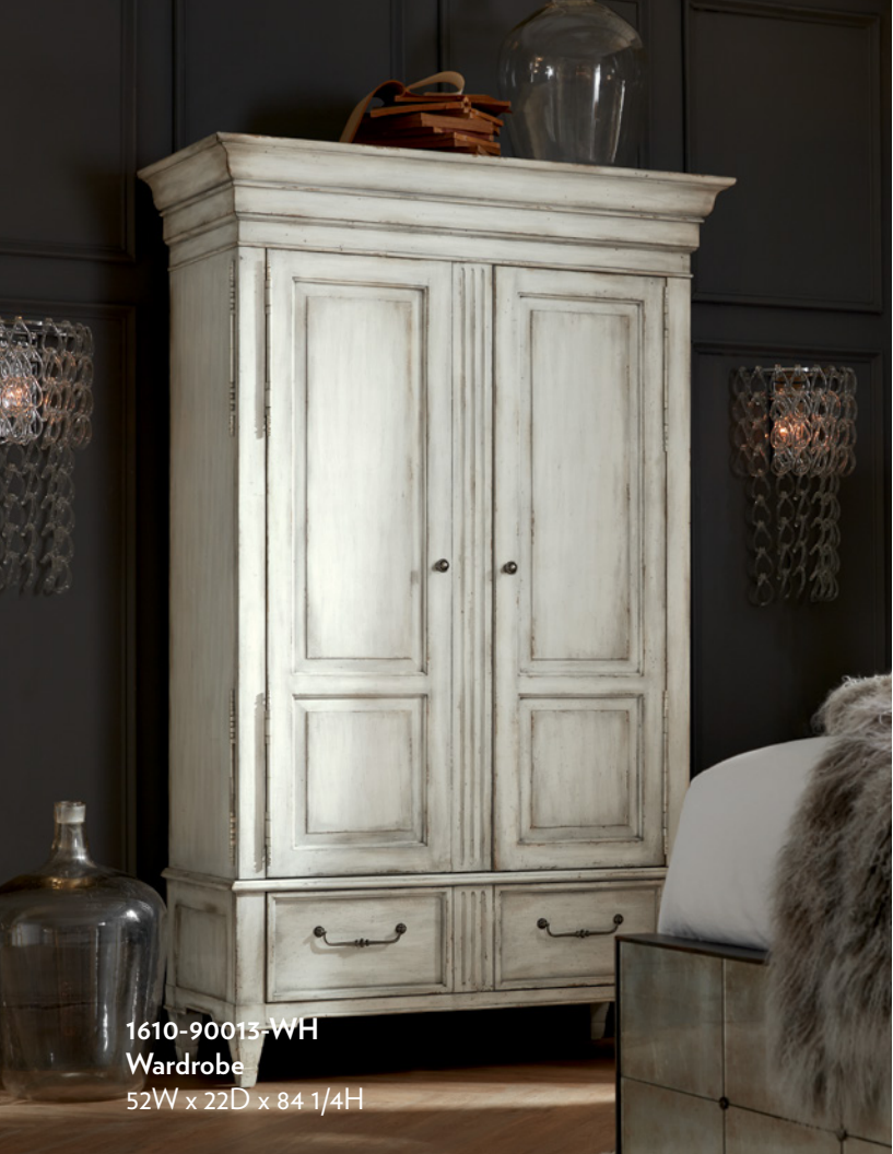
1610-90013-WH Wardrobe 52W x 22D x 84 1/4H