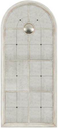
1610-90006-WH Floor Mirror Poplar Solids with Maple Veneer, Eglomise, Antique Mirror and Metal Buttons 36W x 4 1/4D x 82H (91 x 11 x 208 cm) shown on page 18