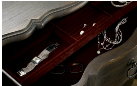
Detail of felt lined drawer