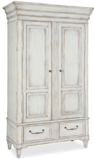
1610-90013-WH Wardrobe Poplar and Hardwood Solids with Maple Veneer and Cedar Two wrap around doors, two interiors drawers, one exterior drawer that is cedar lined, three adjustable shelves, six removable partitions that make nine storage cubbies, ventilated back panel 52W x 22D x 84 1/4H (132 x 56 x 214 cm) shown on page 12, 15