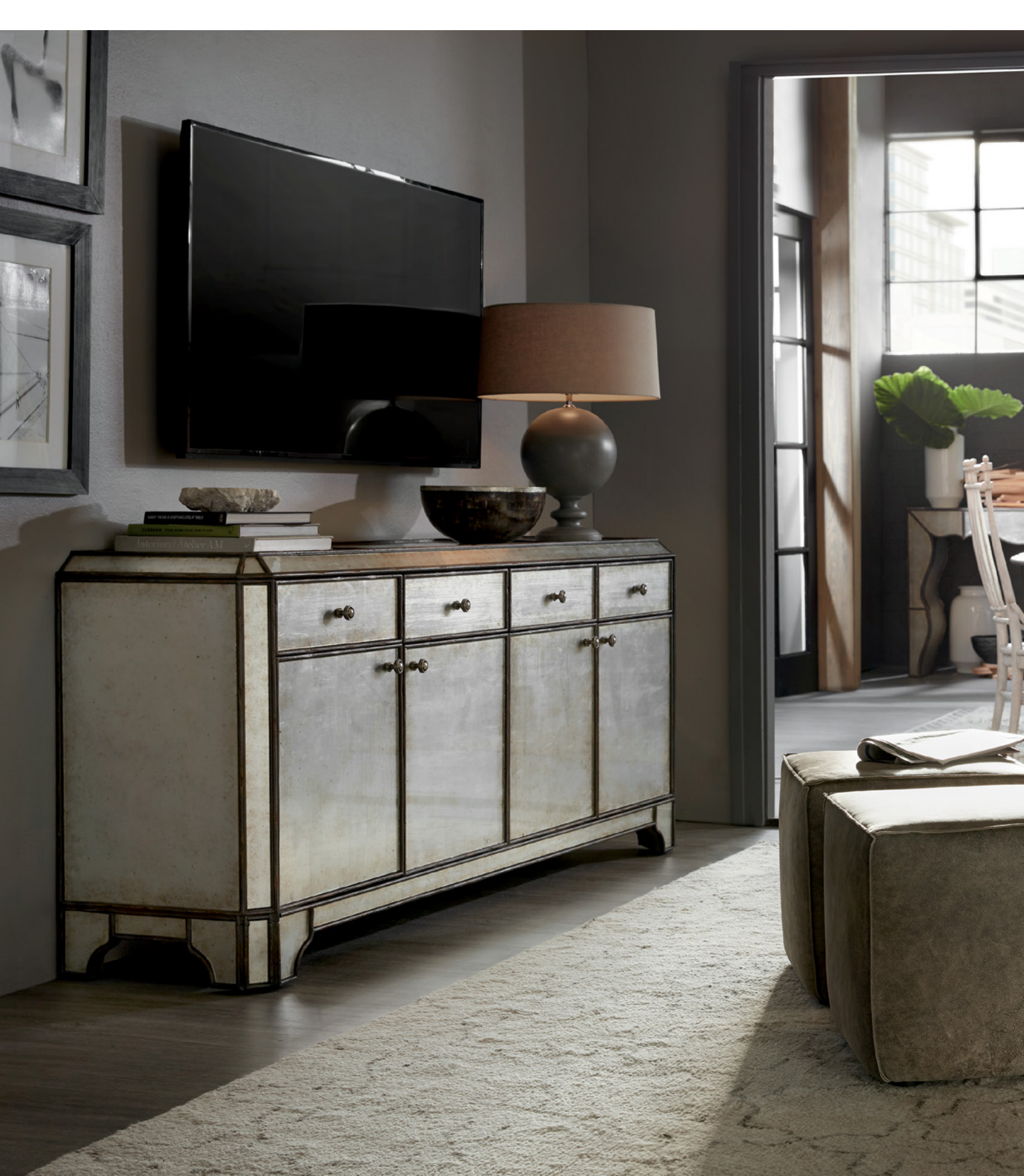
1610-55474-EGLO Entertainment Credenza/Console 74" 74W x 18D x 33 3/4H