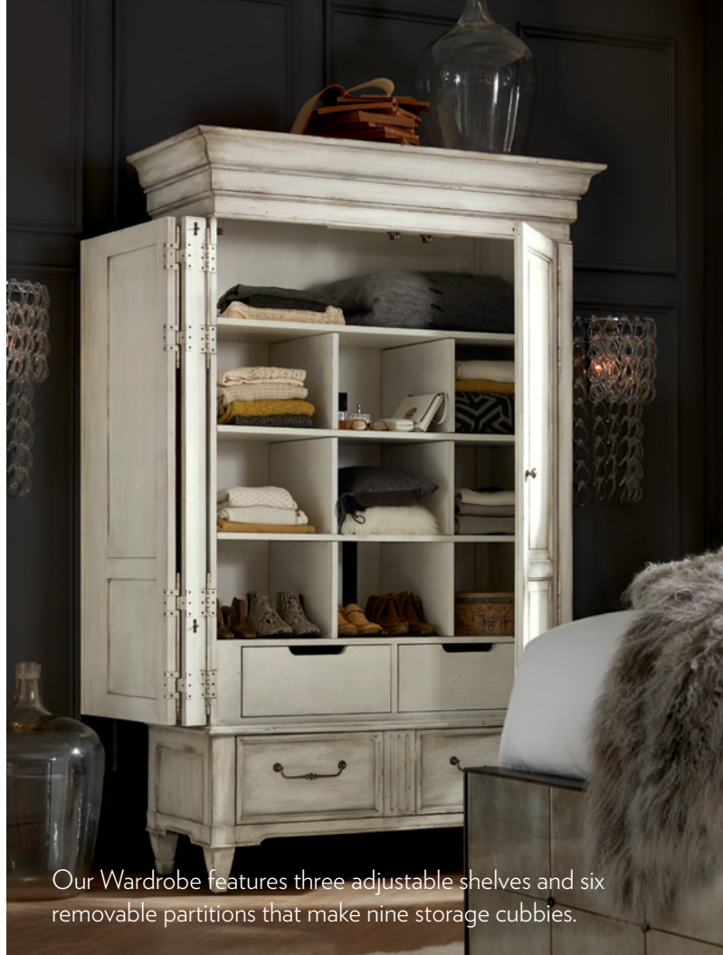
Our Wardrobe features three adjustable shelves and six removable partitions that make nine storage cubbies.