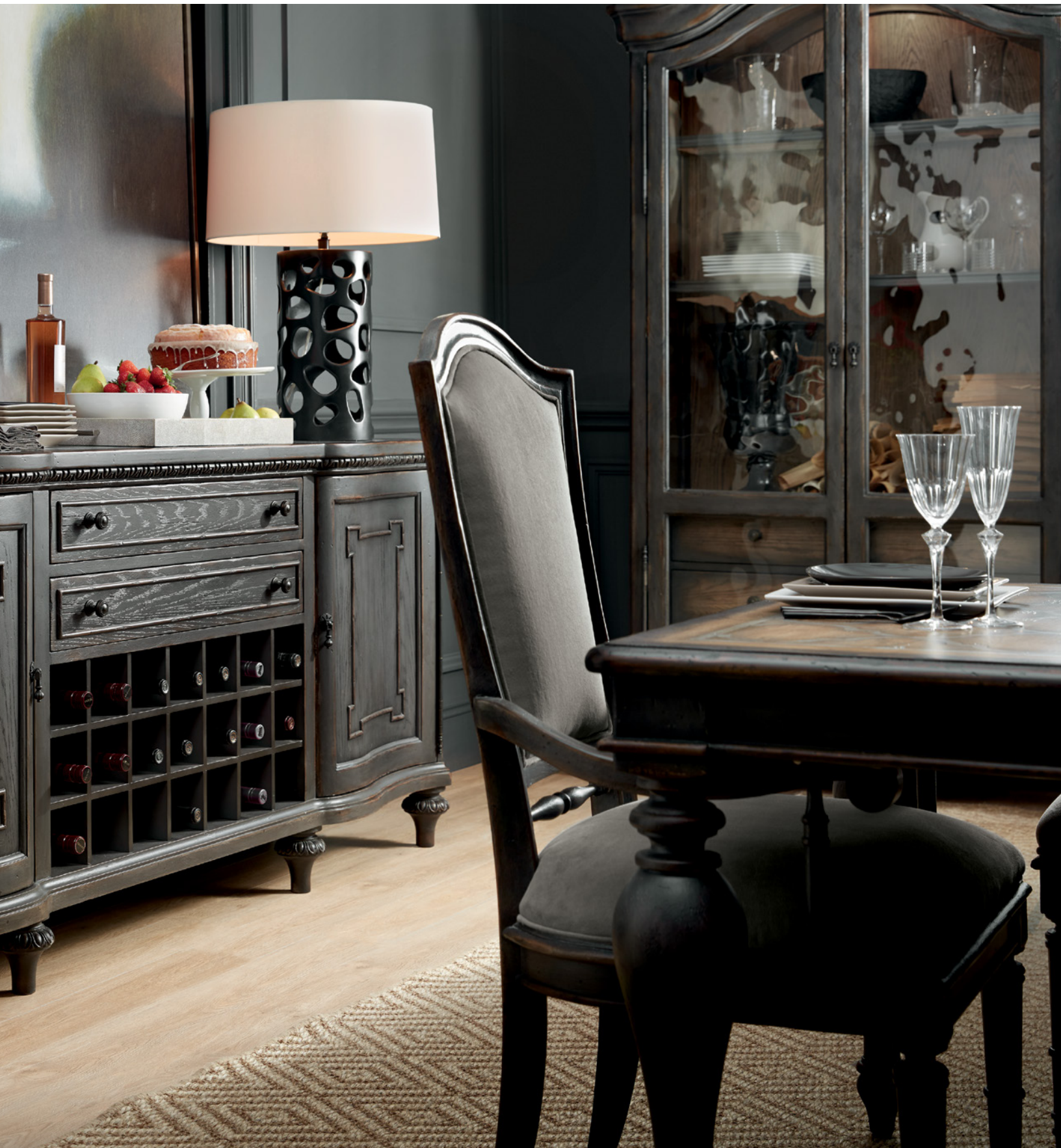
1610-85001-GRY Two-Door Two-Drawer Credenza 88W x 19D x 36 1/2H