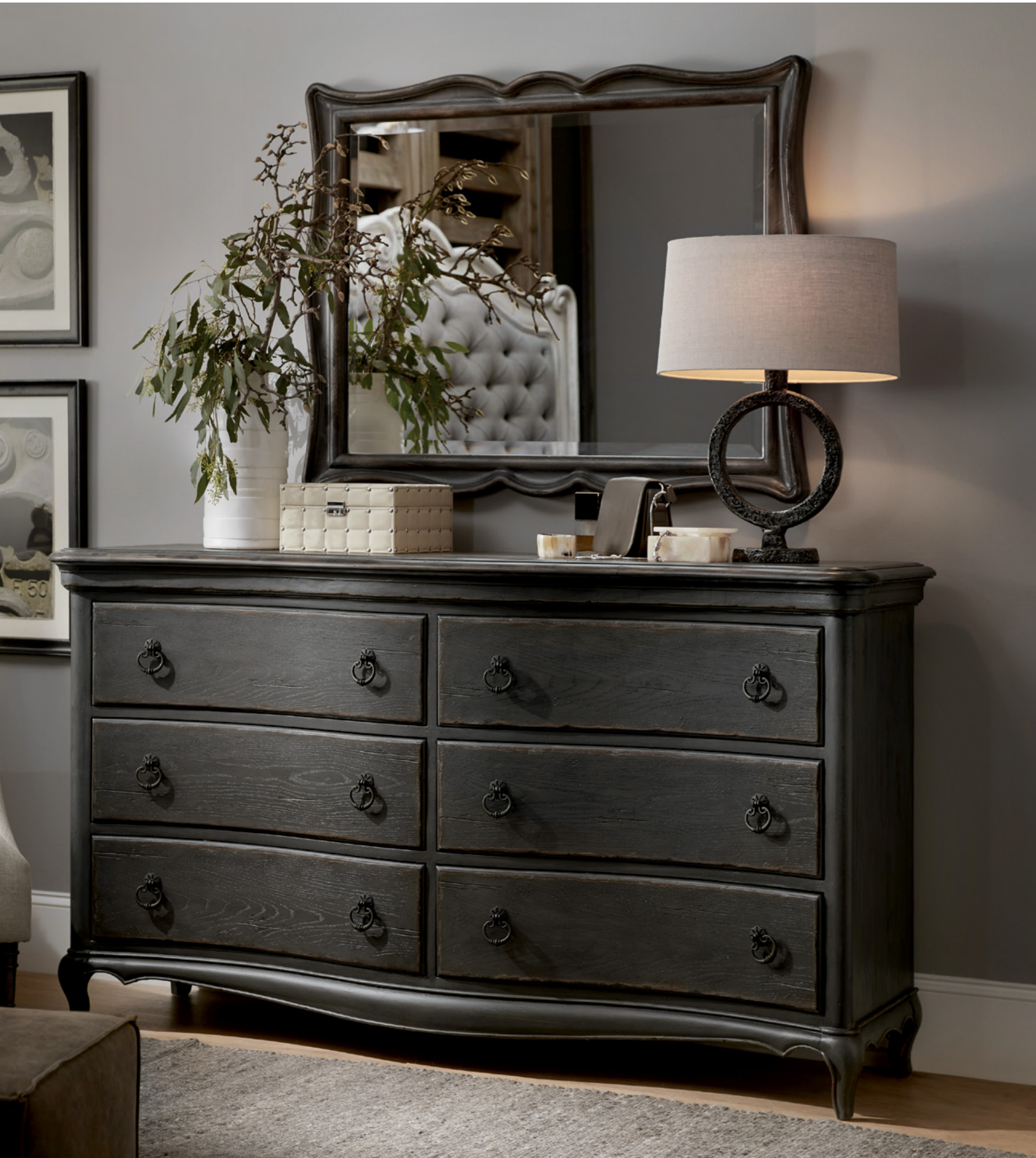
CC498-010 Stephanie Club Chair 29 1/2 x 35 x 36 1/2