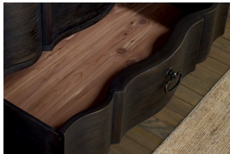
Detail of cedar-lined bottom drawer