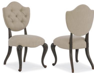
1610-35002-GRY Upholstered Side Chair

Rubberwood and Hardwood Solids with Fabric: Deep Fog 24 1/2W x 28 1/2D x 45 1/2H (62 x 72 x 116 cm) shown on page 4, 30