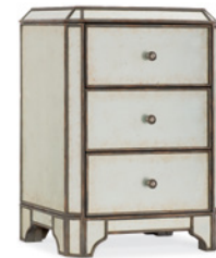
1610-90116-EGLO Mirrored Three-Drawer Nightstand Poplar and Hardwood Solids with Eglomise and Cedar Veneer Three drawers, top drawer has drop in felt liner, bottom drawer has cedar bottom, one live USB port and three electrical outlets, one touch switch located on each side of case, one light underneath, cord clip 22 1/2W x 19D x 32H (57 x 48 x 81 cm) shown on page 20, 21