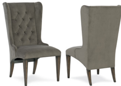
1610-35001-GRY Upholstered Host Chair

Poplar and Rubberwood Solids with Maple Veneer and Fabric: Castle 20W x 23D x 41H (51 x 58 x 104 cm) shown on page 8