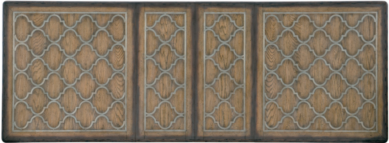
Top View of 1610-75207-MULTI Rectangle Leg Table with Two 20" Leaves extends to 120"