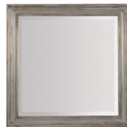
1610-90008-MTL Landscape Mirror

Poplar and Hardwood Solids with Maple Veneer and Resin 42 1/4W x 2D x 42 1/4H (107 x 5 x 107 cm) shown on page 14