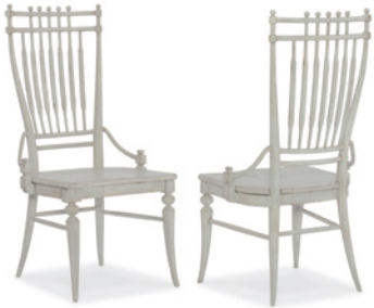
1610-75310B-WH Windsor Side Chair

Poplar, Rubberwood and Beech Solids 22 3/4W x 23 1/2D x 44H (58 x 60 x 112 cm) shown on page 10, 11