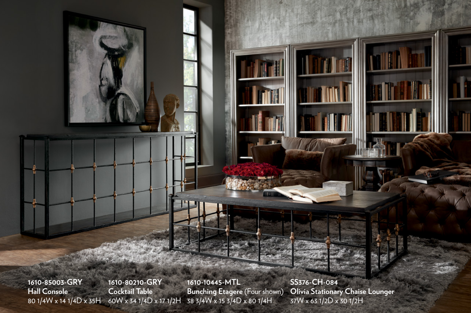
1610-85003-GRY Hall Console 80 1/4W x 14 1/4D x 35H