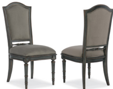
1610-75410-GRY Upholstered Back Side Chair

Rubberwood and Hardwood Solids with Fabric: Deep Fog 23 1/4W x 26D x 44 1/4H (59 x 66 x 112 cm) shown on page 7