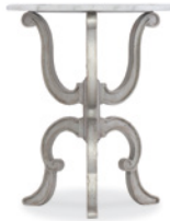
1610-90015-WH1 Bedside Table Metal and Marble 23 Dia. x 27 3/4H (58 x 70 cm) shown on page 16, 17