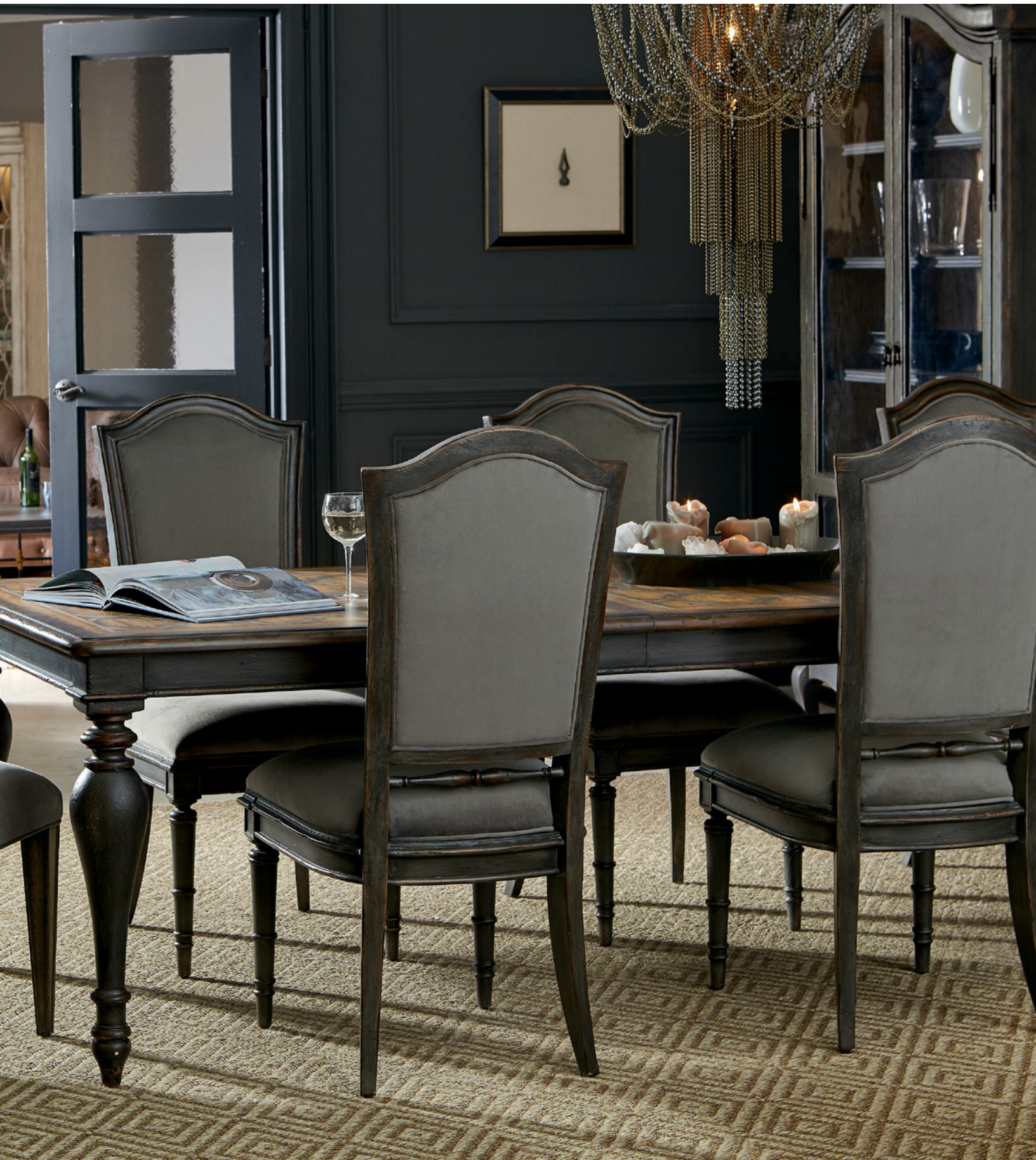
1610-75410-GRY Upholstered Back Side Chair 20W x 26D x 44 1/4H