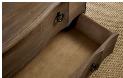
Drawer finished on bottom and sides