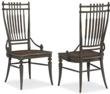
1610-75310A-GRY Windsor Side Chair

Poplar, Rubberwood and Beech Solids 22 3/4W x 23 1/2D x 44H (58 x 60 x 112 cm) shown on page 10, 11