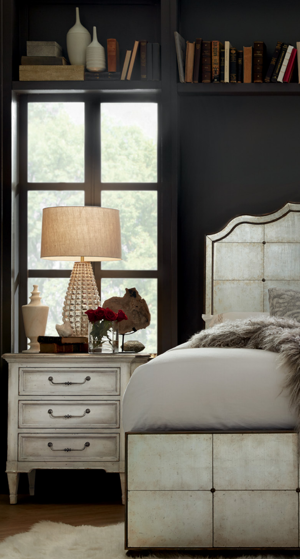
1610-90117-MTL Bachelor's Chest 36W x 19D x 34H