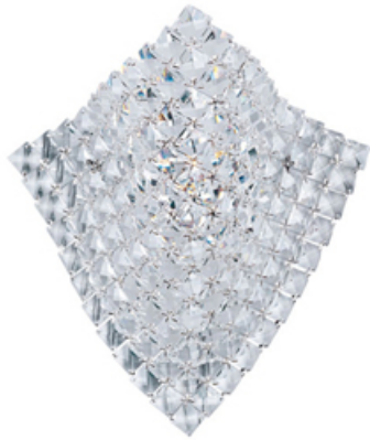
E24270-20PC Wave 1-Light Wall Sconce