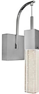
E22760-89PC Fizz III 1-Light LED Wall Sconce