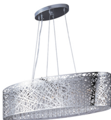
E21310-10PC Inca 9-Light Pendant