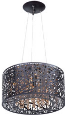
E21309-10BZ Inca 7-Light Pendant