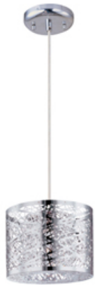
E21306-10PC Inca 1-Light Pendant