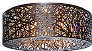
E21301-10BZ Inca 9-Light Flush Mount