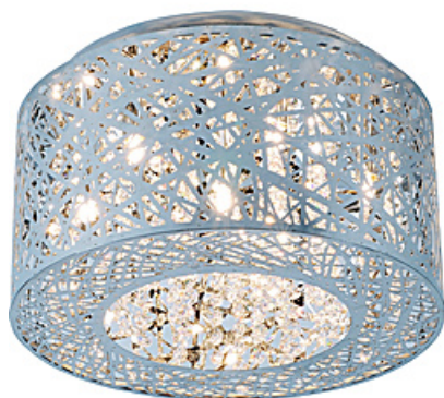
E21300-10PC Inca 7-Light Flush Mount