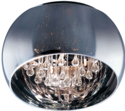
E21200-10PC Sense 5-Light Flush Mount